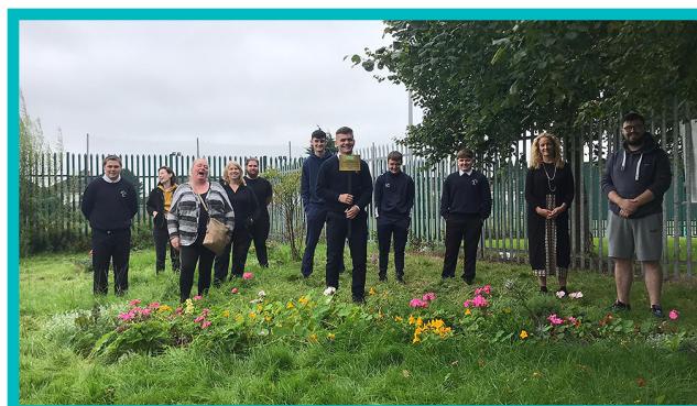
Best Youth Group Garden - Sports Scholarship Garden