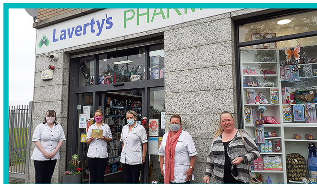
Best Shop Front - Lavery's Pharmacy