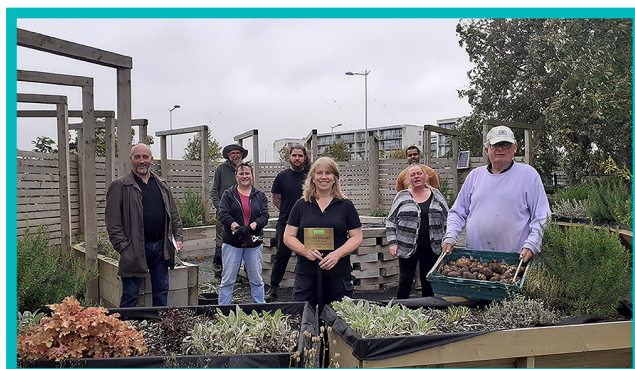
Best Community Garden - Muck and Magic