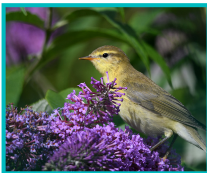
Willow warbler, allotments