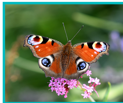
Peacock butterfly, muck and magic