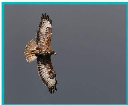
Buzzard at Ikea